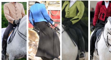
14 points with classical boots and trousers