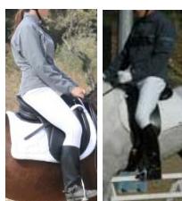
Classic dress : 8 points