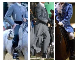
16 points FULL DRESS